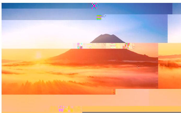
Sunrise in Niseko - one of Stuart's families favourite places to visit and relax.